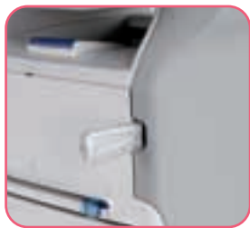
Wireless printing thanks to a WLAN dongle connected to the machine.