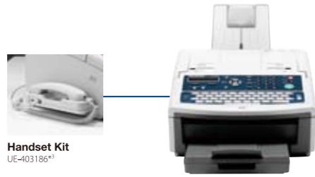
Handset Kit UE-403186**